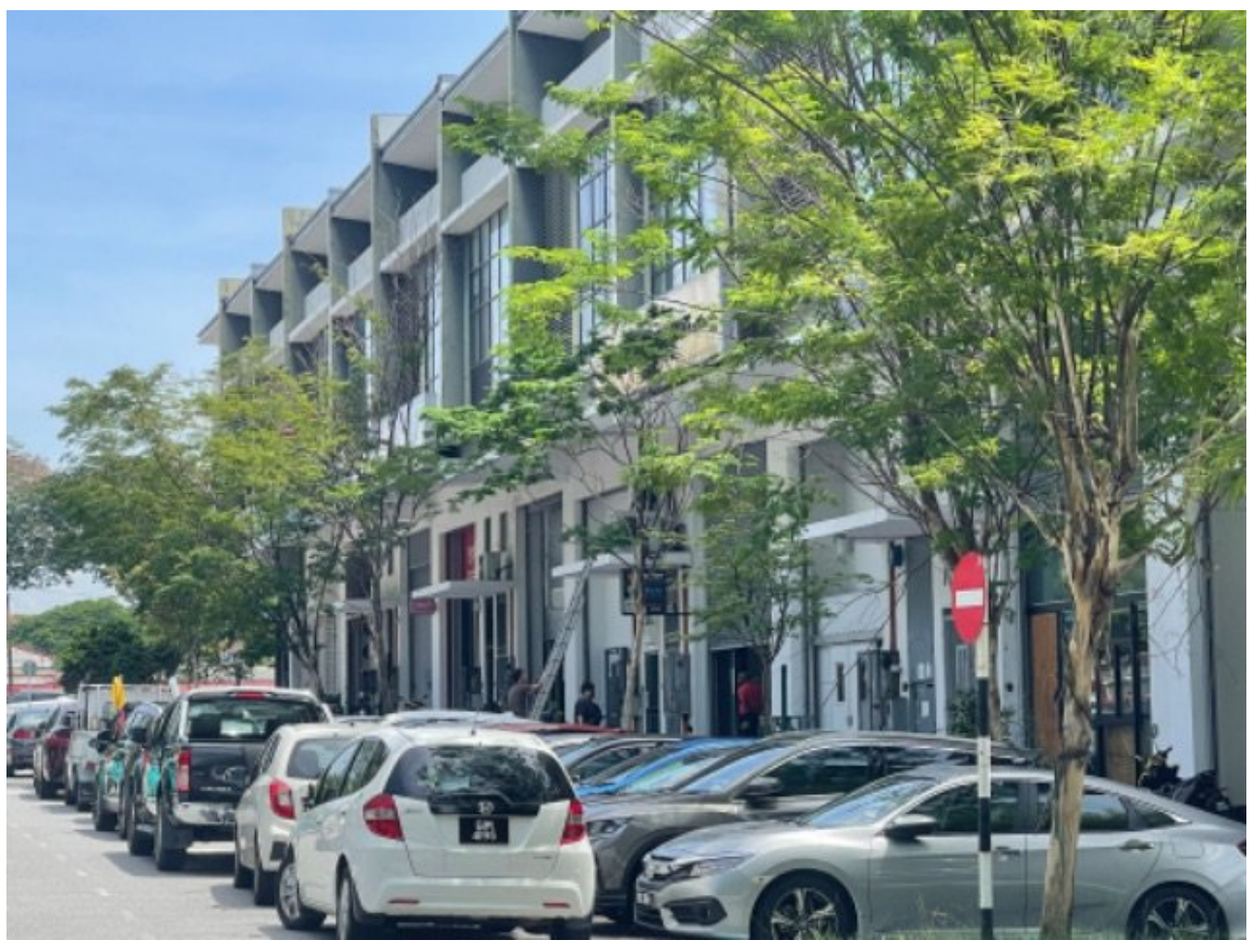
Page 3 of 5