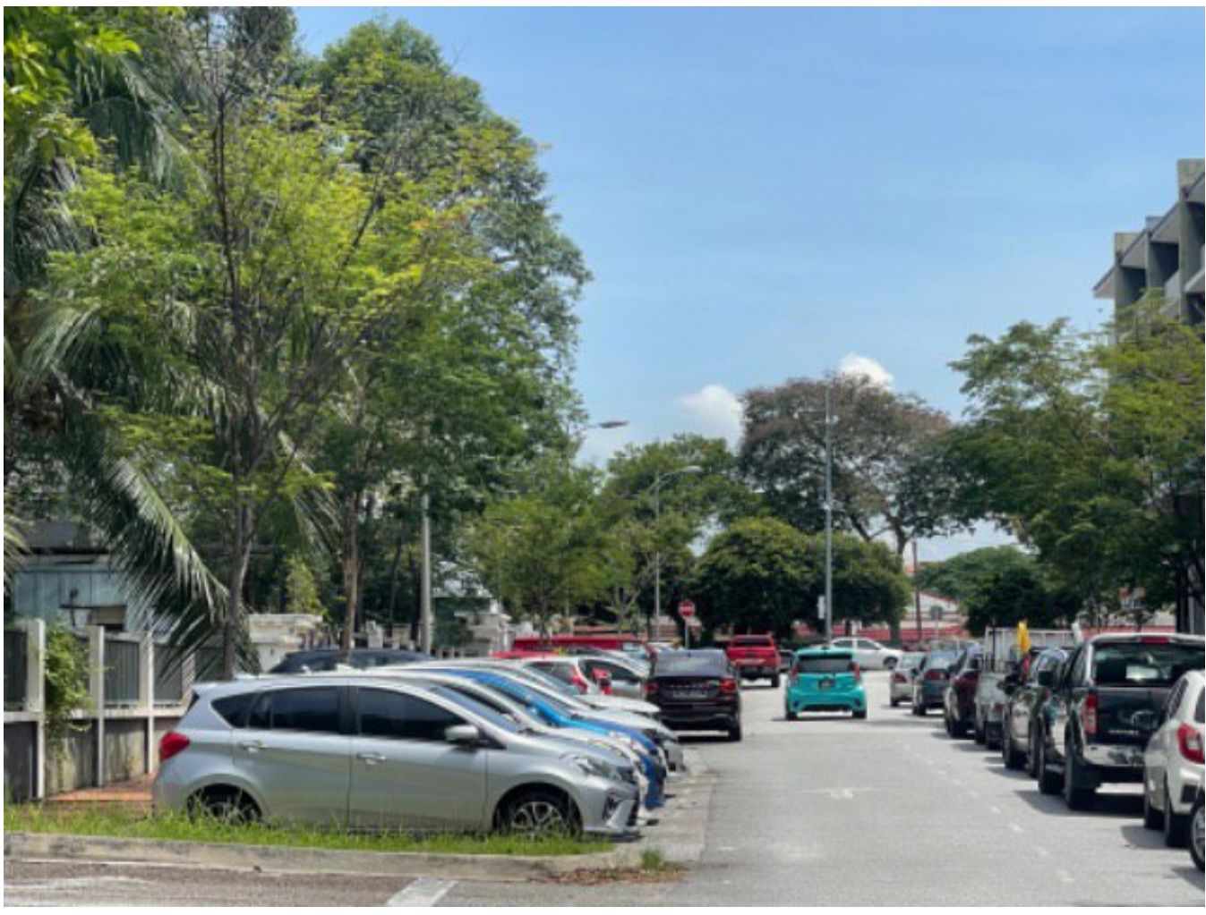
Page 4 of 5